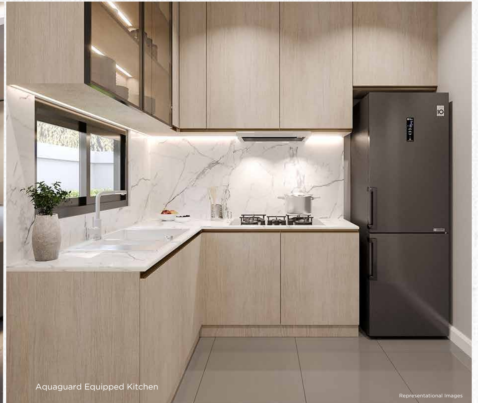
Aquaguard Equipped Kitchen