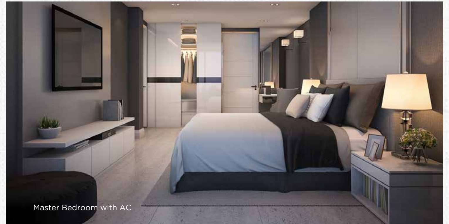
Master Bedroom with AC

Intelligent space management, optimum utilization of floor space and a host of other technical factors define living the Palladian way of life.