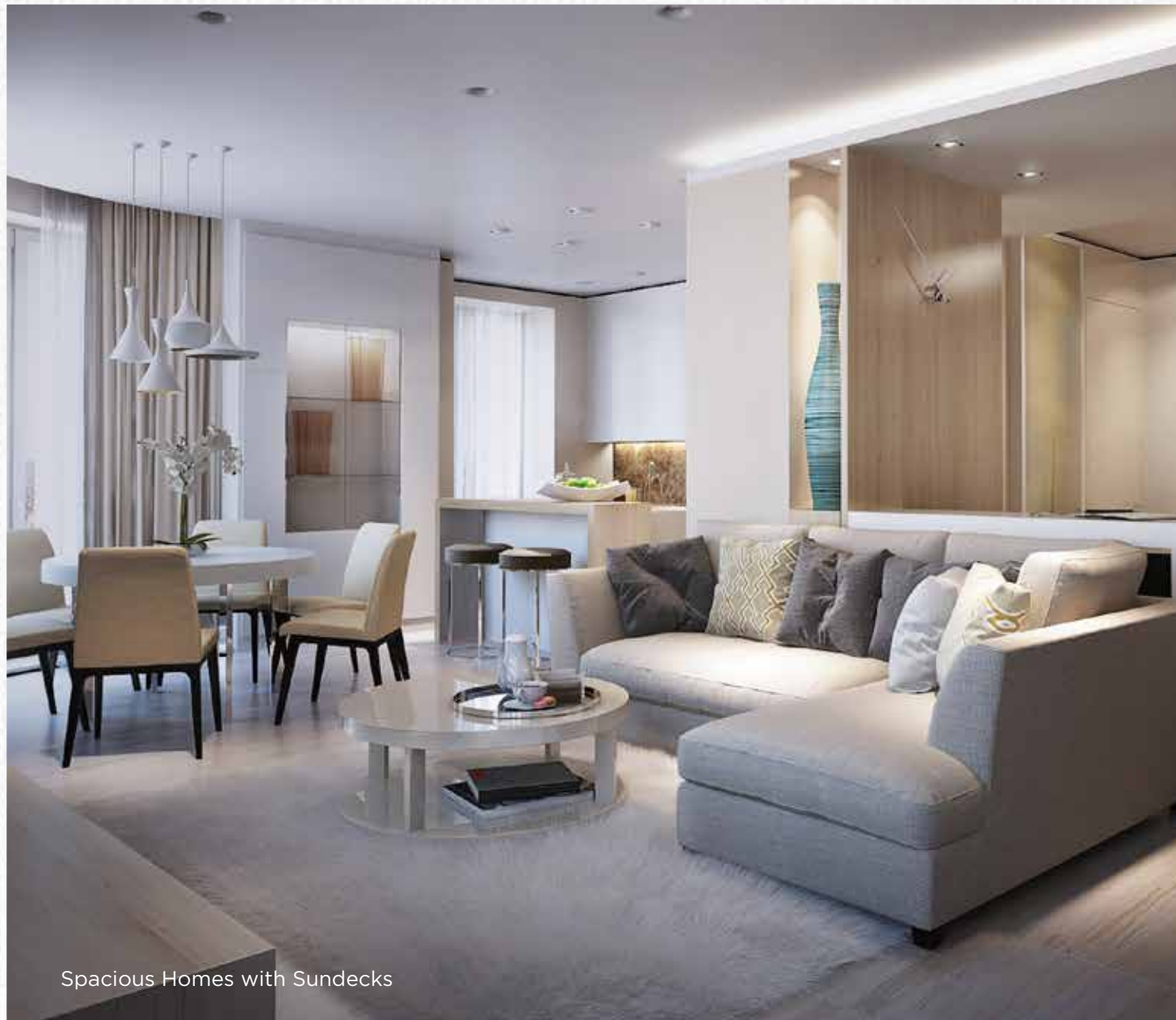
Spacious Homes with Sundecks